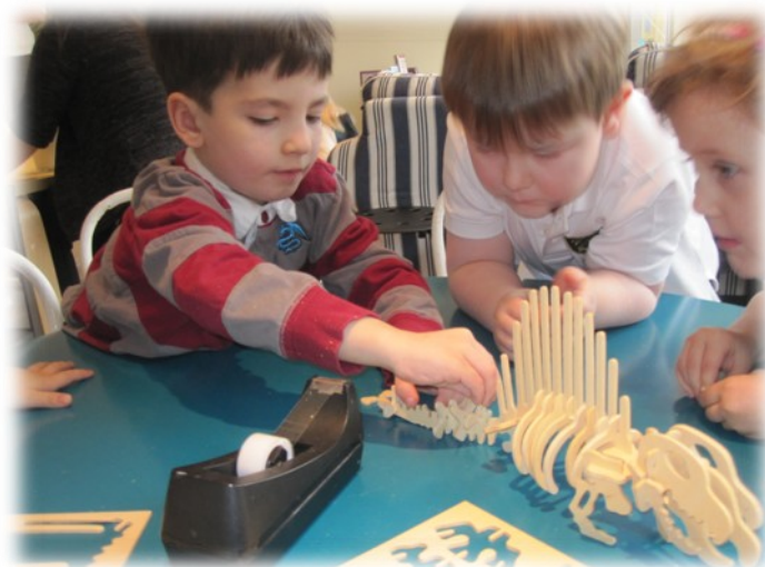
The children work together as a team to put together a dinosaur skeleton.