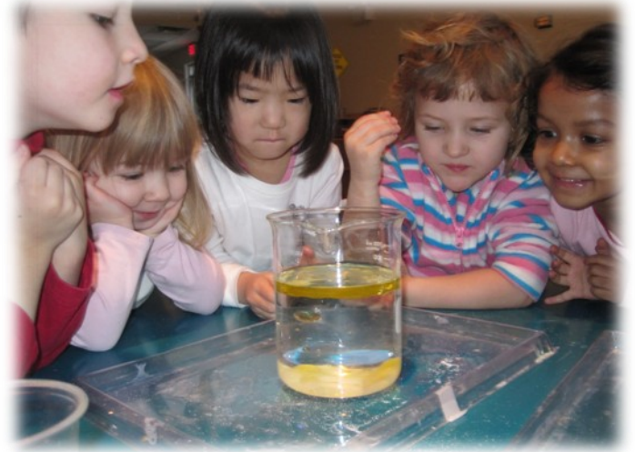
The children take part in an experiment with Ms Fannie where they learn about density. The children watch as the oil floats on top of the water but soon begins to sink as salt is added to it.