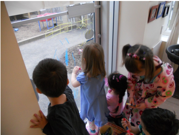
The children are decorating the door using special window drawing markers.